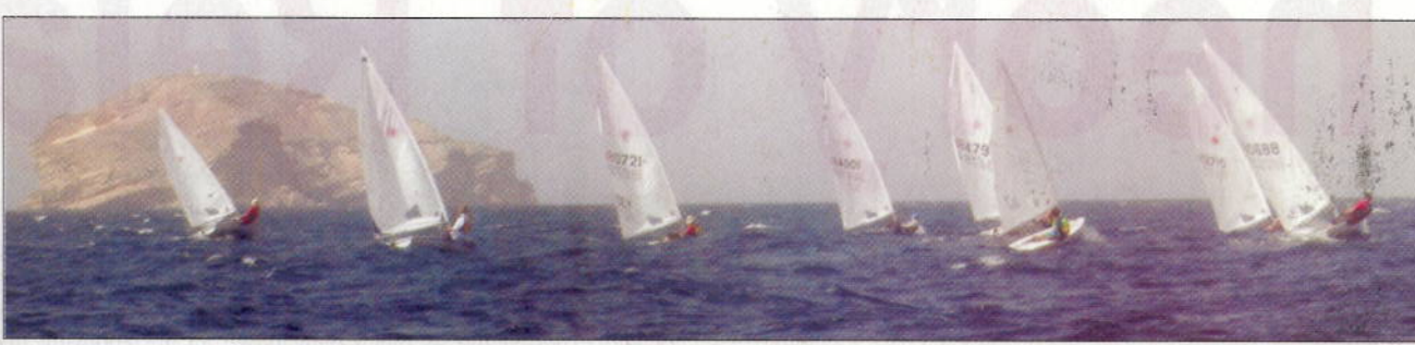
The fleet just after the start sailing towards the windward buoy in very strong wind

The first racing day saw very strong easterly winds throughout the day. Wind speeds up to 20 knots (force 5) created very reation Club), Oman Sail and demanding conditions which only part of the fleet could han-Douwe Sickler came out on dle. The first race started with top with 9 points (out of 8 rac- 22 sailors. Only 14 were able to complete the course. The number of finishers reduced in every race to only 7 in the fifth and final event of the day. Those that made that last race Rashid Khalfan al Yahyai came back to the beach totally from RNO-Wudam was the exhausted. Sailing a Laser in best Omani sailor at 11th place strong winds is physically deoverall, an excellent perform- manding. One has to be very ance. It is the third time he fit! At the end of day-1 Douwe takes this position. Abdul- had 2 wins and was already 3