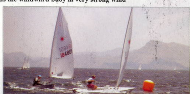
Excellent sailing conditions made for a very exciting competition

The Laser is a small single sail boat sailed by one person. It is an Olympic single design class which is very popular around the world. Laser sailing is a fantastic sport which can be practised in Oman throughout the year. In strong winds the sailing is very physical; the boat gives you a great workout. With Oman's strong history of sailing, good winds, beautiful beaches and deep blue sea, Laser sailing has the prospective to become a true national sport with the potential of Omani participation in world class events such as the Asian and